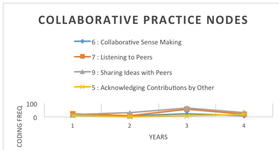
Figure 2: Summary of heavily coded nodes categorized by collaborative practice for all students by years.

Collaborative problem-solving practices. There were four heavily coded nodes for student collaborative work practices that emerged from the analyses (see Figure 2), three of which are aligned with discourse practices (e.g., Manouchehri & St. John, 2006): collaborative sense making , listening to peers , and sharing ideas .