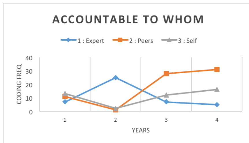
Figure 3: Summary of heavily coded nodes categorized by accountable to whom for all students by years.

From the summary line chart shown in Figure 3 we can see that observed instances of reliance on peers peaked in Year 3 and was maintained in Year 4. Observed instances of reliance on self grew steadily from Year 2 through Year 4 and over the same period observed instances of reliance on expert decreased steadily. These observations taken with the accountable to whom perspectives, we conclude that students made a shift from relying on knowledgeable others to relying on themselves and/or peers and they were sufficiently confident to risk being wrong, yet free enough to be influenced by collaborations.